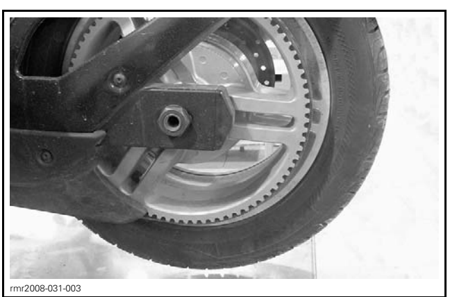
TYPICAL - SWING ARM ALIGNS WITH A SPOKE

6. Turn rear wheel to align a wheel spoke with the swing arm.