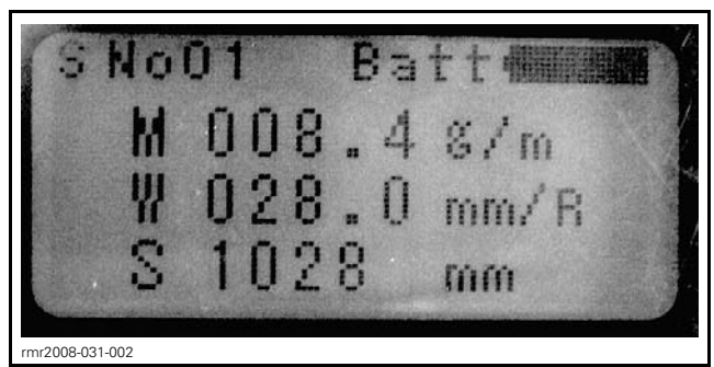
SONIC TENSION METER DISPLAY

NOTE: Refer to the manufacturer's instructions to set the informations into the device.