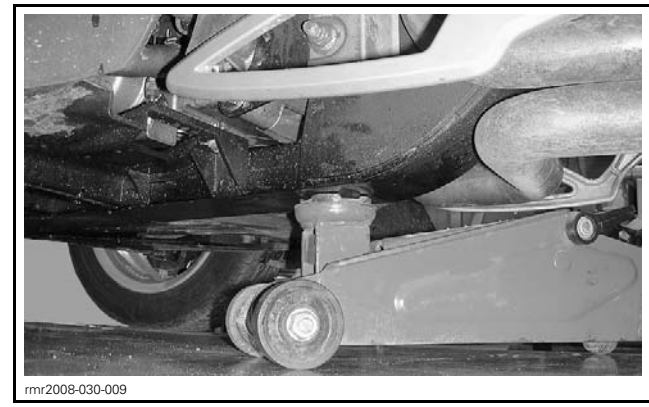
TYPICAL - LIFT BY THE FRAME

NOTICE Do not lift under rear shock absorber. Always lift by the frame. Refer to illustration.